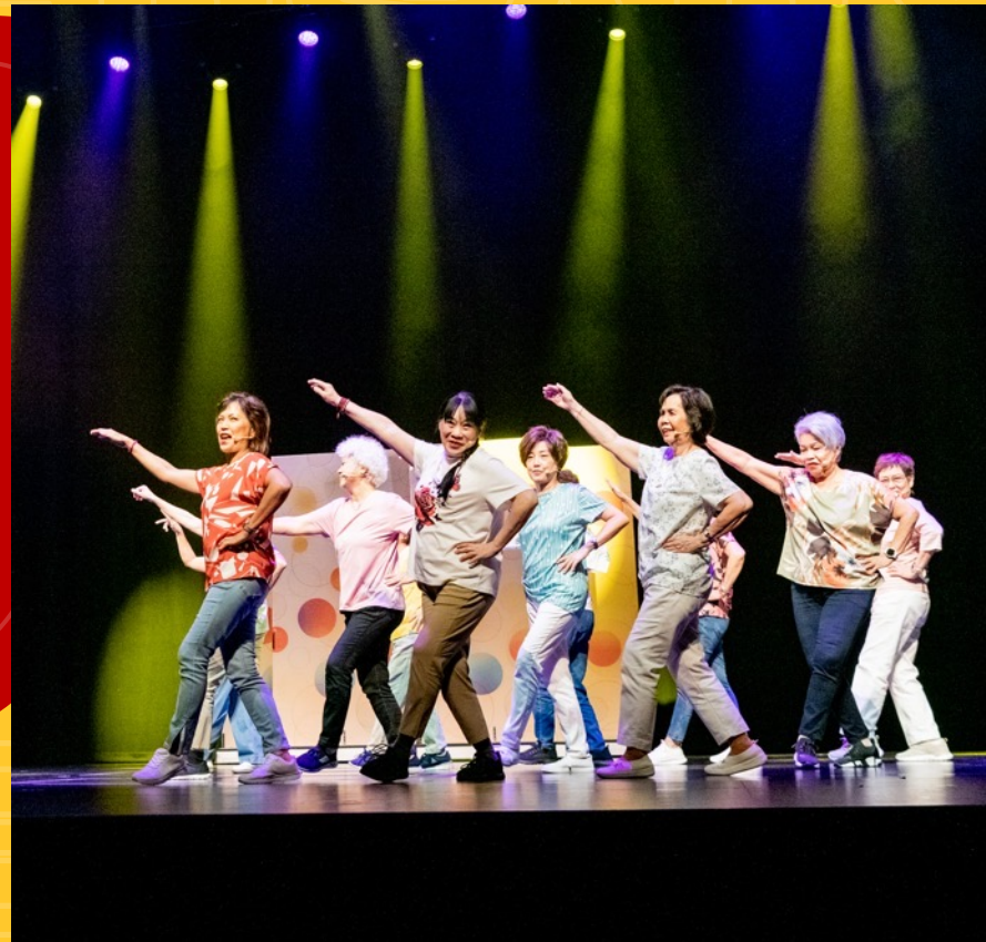
Pictured: "Live It Up" by The Glowers Drama Group Presented by Gateway Theatre in Sunshine Festival 2025

In 2027, Gateway Theatre is celebrating its 10 th anniversary with programmes for audiences of all ages. If you have a show for children, seniors, or anyone in between, there's a place for your work at Gateway Theatre. Apply now!