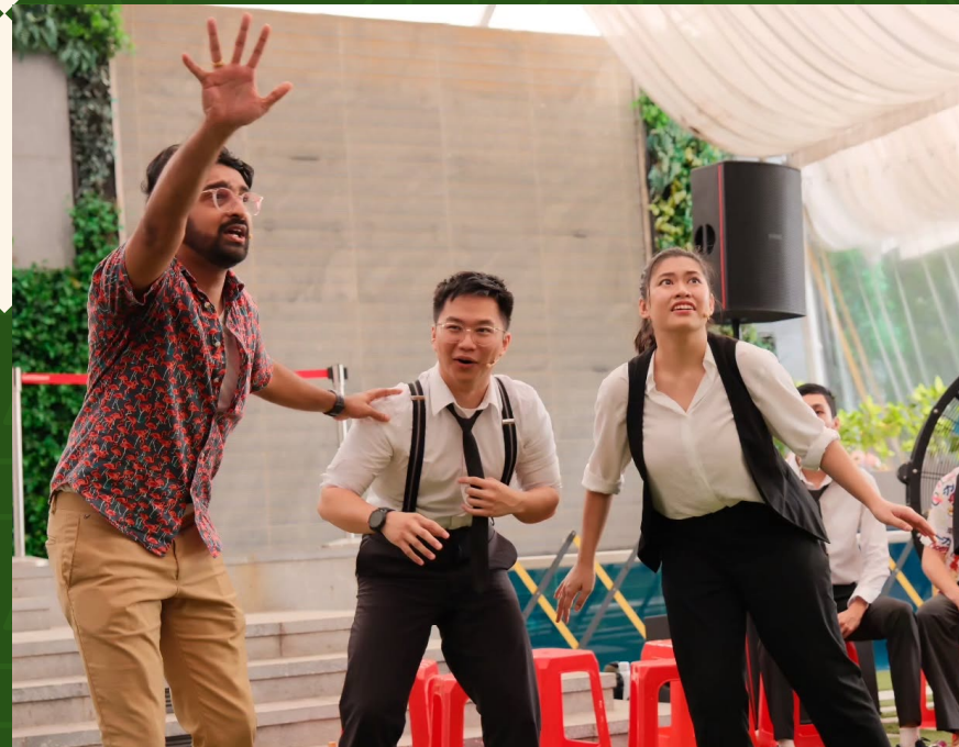
Pictured: “IMPROVHIBITION!!” by Improver Conduct, featuring The Modern Schemers & supported by Gateway Theatre