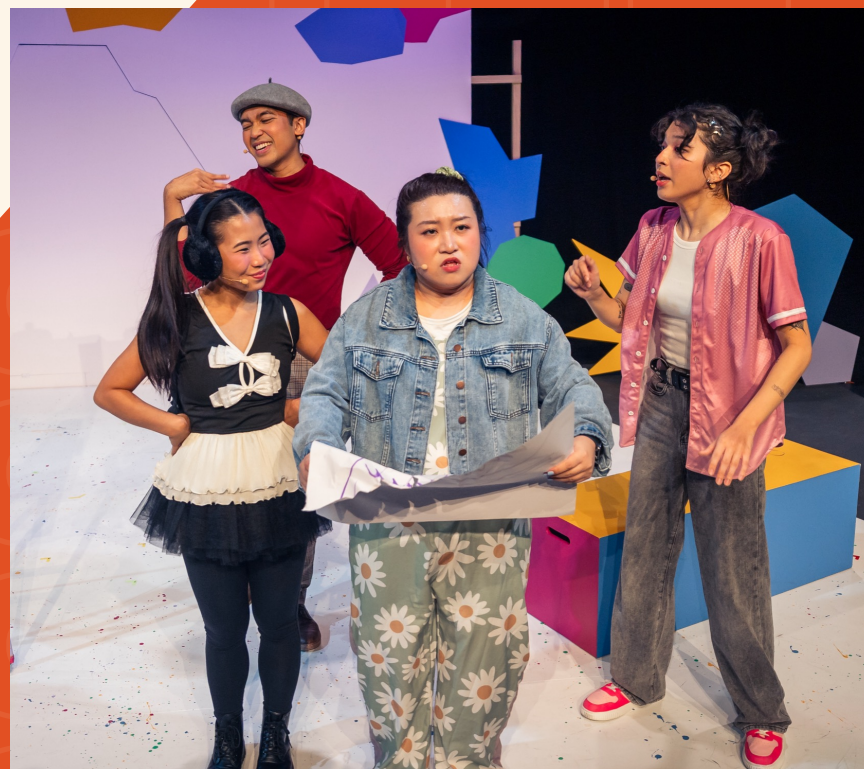
Pictured: “Beautiful OOPS!” by Freddo Children’s Theatre, supported by Gateway Theatre as part of Little Big Feet 2025