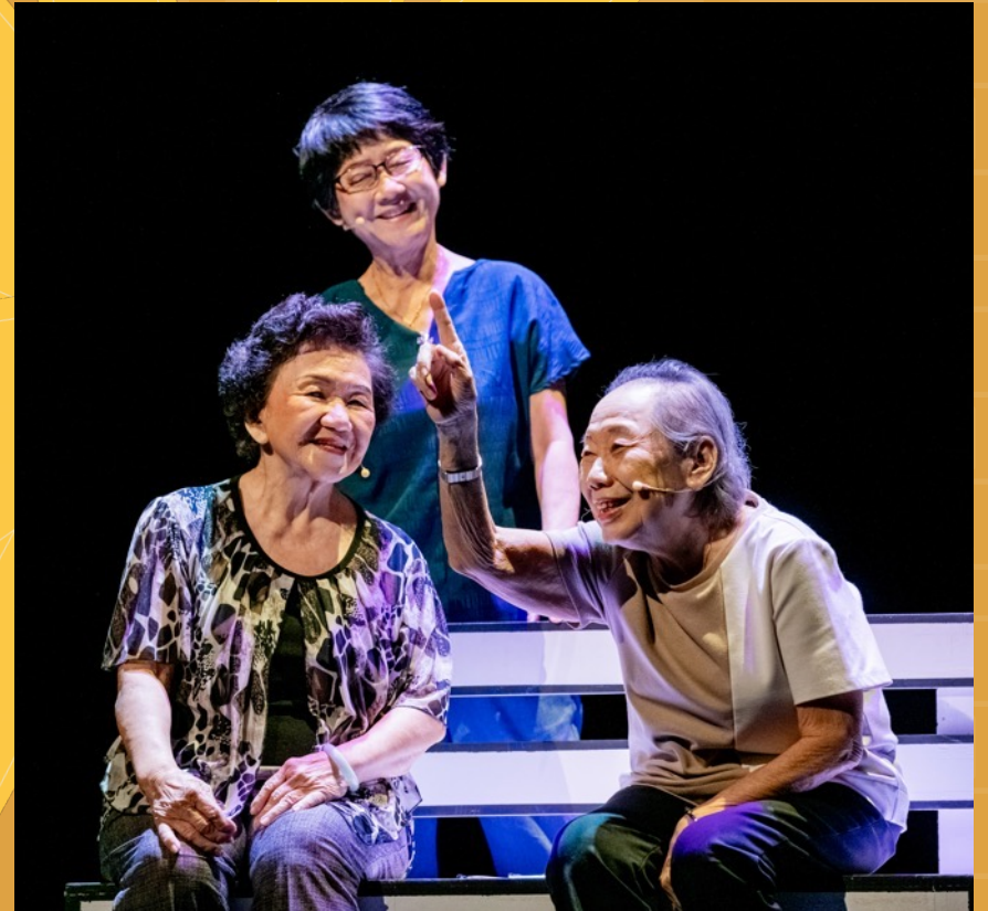
Pictured: “Live It Up” by The Glowers Drama Group Presented by Gateway Theatre in Sunshine Festival 2025

“Vibrant aging is about staying curious in mind , connected at heart , active in body and inspired in spirit to embrace every stage of life”